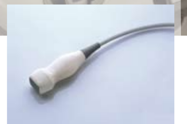
2P2 Phased Array Transducer